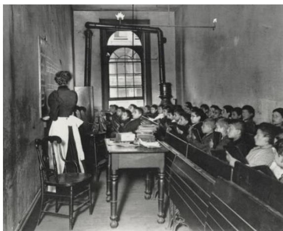
'Class in condemned Essex Market School: Gas burning by day' Photo J. Riis ( http://goo.gl/Dsh6cg )

relevant are a range of techniques in “Deep Viewing” in critical visual pedagogy as developed by Pailliotet (1998) and ways to nurture the “imagination of resistance” (Berry, 1998).