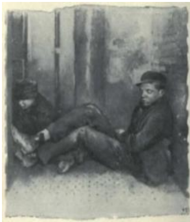
‘A snug corner on a cold night’

Present these photos/drawings below and ask students to discuss and describe what they see, or engage in interior monologuing. Here Riis’ photo of an impoverished Jew (http://goo.gl/ZrQm8F) on Sabbath eve, living in a coal cellar in NY (ca. 1890). Students can explore this article about Riis’ photos of the NYC poor (http://goo.gl/gWkhJS) from the 1880s on; here a tenement child (http://goo.gl/vfd3eL). A lesson plan (http://goo.gl/13MqUt) on a Riis photograph documenting poverty, ca. 1890, suggests projects and numerous source material links. Reflect on this iconic photo (http://goo.gl/vXHFhc), one of Riis’ most famous. Below two photos of street children that students can explore, they can click on the links for a larger photo. Ask students: what has driven these kids into the street?