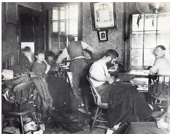
'Knee-pants at forty-five cents a dozen – a Ludlow St. sweater's' ca. 1890. On the wall a Jewish 'marriage ketubah ' ( http://goo.gl/bajH1j )

frame these images of working-class life worlds. Also