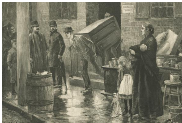
Tenement eviction, Harper's Weekly , 1 Feb. 1890 Collection M.K. Blanck ( http://goo.gl/J3RM8E )

Inability to pay rent and evictions of the poor: how do the children feel, the mothers evicted? Such duress regarding payment of rent and evictions were common in the tenements, a theme in Riis' tales. As Hill (2017) notes, speaking of here & now, it strongly echoes capitalist inequities in the past: