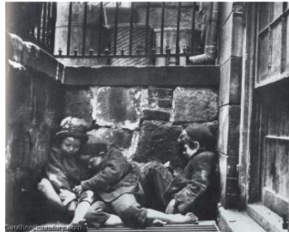
‘Street Arabs sleeping in Mulberry Street’

From J.A. Riis, How the Other Half Lives , Ch. XVII