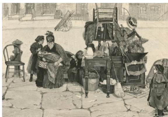
Tenement eviction, Scribner's , June 1892