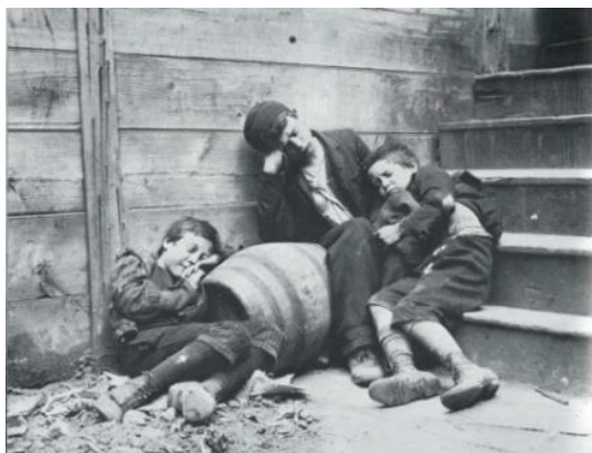
‘Street Arabs [homeless kids] in their sleeping quarters’

Keywords: Jacob Riis, Critical Pedagogy, TEFL, Gilded Age, social empathy theory, poverty, migration, housing