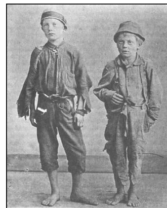
‘Homeless children’ ca. 1890

Photo, Jacob A. Riis, 1890 ( http://goo.gl/86wNYa )