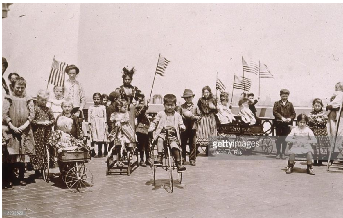
Jacob A. Riis, Children of detained or waiting immigrants on the new rooftop garden of Ellis Island Immigration Station, ca.1901 (July 4? ( http://goo.gl/WX6xTd ) This is the Second E.I. Station ( http://goo.gl/9mAiz9 ), opened December 1900. Today it houses an Immigration Museum ( http://goo.gl/XrhR6V ).