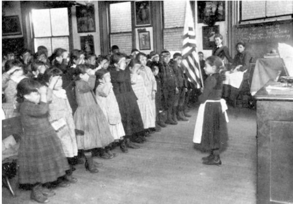
Italian immigrant children saluting the flog at the Mott Street Industrial School ca. 1900 [note the brick wall outside the windows, the pupil's grimy clothing, the extreme overcrowding, two young intent teachers, not saluting]