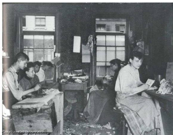
'Necktie workshop in a Division St. tenement' 1889

relevant are a range of techniques in “Deep Viewing” in critical visual pedagogy as developed by Pailliotet (1998) and ways to nurture the “imagination of resistance” (Berry, 1998).